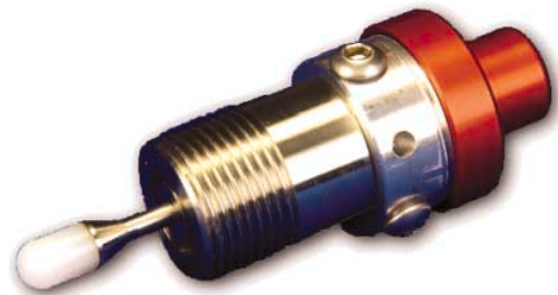
CARTRIDGE COLOR CHANGE VALVE